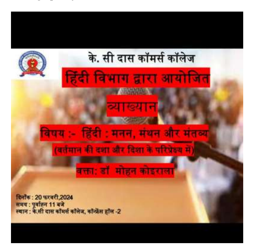
Photographs of the Event with Banner: